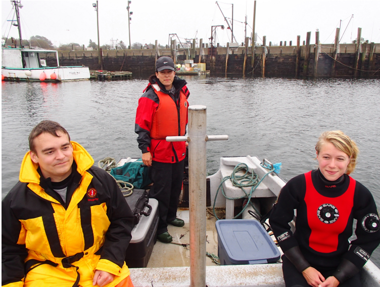
The Tagging Team for 2013: (L to R)