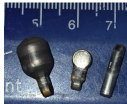
Figure 7: ATS JSATS Pinger Models SS440 (left), SS300-337 (center), SS410 (right) shown here roughly to scale. The graduations are in cm.