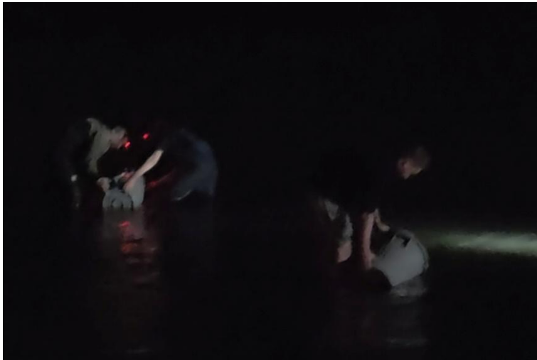
Figure 18: Night release of tagged and pinger implanted eel

Spawning detection is a new concept for PSAT tags, and it provides new research opportunities. Yet, operating a PSAT tag with an acoustic pinger detector adds additional complexities. At the conclusion of the eel tagging project, I asked the DTU team if my support of the work in the Azores was necessary. The unequivocal answer, they could not have done it without my presence.