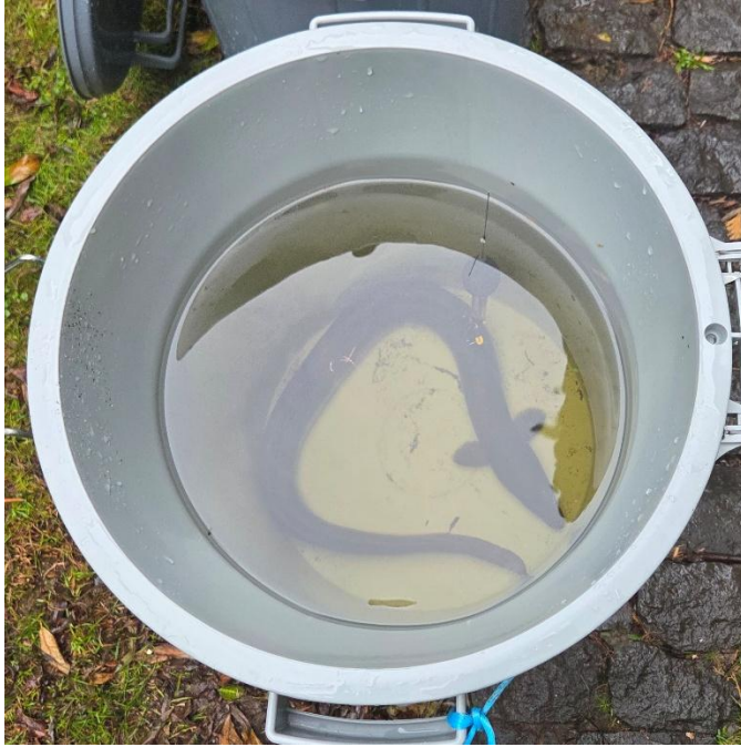
Figure 12: Monitoring pinger detection after implantation and tag harnessing has the advantage that the entire acoustic signal path from inside the fish to the SeaTag-3DS detector is verified. This is a better test! But, it also requires that the fish is monitored immediately. And it must be fairly dark to spot the blinking green LED pattern of the tag reliably.

This manual described tag configuration at the factory, and activation using the light sleeve method. An alternative is the use of the SeaTag-SAM docking station. This device lets you configure the tag, obtain special reports such as ping detection statistics, switch the tag between its operating states and install updated firmware. This does require additional knowledge and involves the cost of the docking station and a notebook PC. So, it is a bit of an ‘expert mode’. Contact DSS if you want to learn more or obtain a quote.