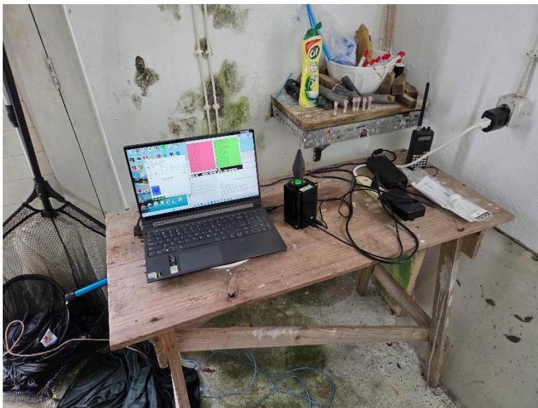
Figure 13: For the DTU project, we used on-site configuration of the tags using a specialized tag docking station (center with SeaTag-3DS inserted) and notebook PC. This provides flexibility in the field. But also requires additional knowledge and equipment.

This manual described tag configuration at the factory, and activation using the light sleeve method. An alternative is the use of the SeaTag-SAM docking station. This device lets you configure the tag, obtain special reports such as ping detection statistics, switch the tag between its operating states and install updated firmware. This does require additional knowledge and involves the cost of the docking station and a notebook PC. So, it is a bit of an ‘expert mode’. Contact DSS if you want to learn more or obtain a quote.