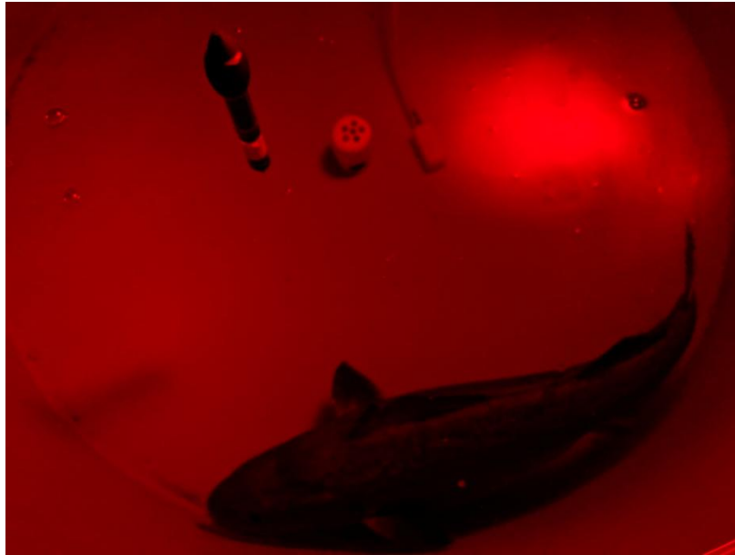
Figure 2: A SeaTag-MOD PSAT equipped with a JSATS signal detector ‘payload section’ floats near a sable fish with an injected ATS SS400 JSATS tag in a tank at NOAA’s Manchester research lab

subsequently placed into a small tank. A SeaTag-MOD with the JSATS pinger detector floated nearby and successfully detected the repeated pinger transmissions in an overnight test.