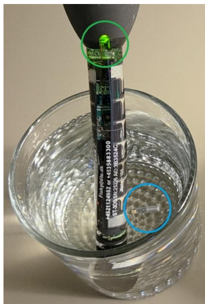
Figure 11: Monitoring first pinger detection before tagging the fish: A JSATS pinger (in blue circle) is activated and a SeaTag-3DS tag is switched to On-Fish state. Both are placed into a water filled container. After SeaTag-3DS detects and verifies the pinger signal, it flashes its LED green (green circle) for thirty seconds to confirm. Care must be taken that the surgical procedure is fast enough and the tagged fish is placed in a holding tank before the tag declares pinger signal loss. Or else the release mechanism will fire!

Monitoring before tagging the fish: Switch the tag to On-Fish, and make sure the pinger is activated and at the correct PRI that matches the tag configuration. Place the tag and the pinger in a water filled bucket or similar. Keep the light low so that you can observe the tag LED. The pinger detection process starts once every 4 minutes. It is indicated by a 'long' yellow blink (0.5 second long) that is distinct from the 1/16 th second heartbeat blinks of the tag. If the tag detects three pings in a row at the expected interval, first detection has succeeded. This is indicated by the green LED flashing for 30 seconds. If the correct ping sequence has not been detected, there will be a red blink (0.5 seconds), and the process repeats at the next 4-minute interval. You can now implant the pinger and attach the tag to the fish. But be careful: For this method, you must be sure that pinger implantation, tagging and fish release into a holding container is complete in less time than PD_APAUSE * PD_AFAIL. Or else the release mechanism will trigger.