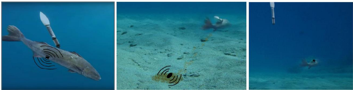
Figure 1: Spawning event detection concept. Left: An external PSAT tag (SeaTag-3DS) detects the acoustic pings from a JSATS pinger implanted in the fish ovary or oviduct. Center: As the fish spawns, the pinger is ejected with the spawn. Right: When the fish departs and the pinger signal is no longer detected by the PSAT, it separates from the fish and rises to the surface to report the time, location and circumstances of the possible spawning event.

In response to a NOAA SBIR solicitation, Desert Star Systems proposed a concept in which a small acoustic pinger would be implanted in the oviduct or ovary of a target fish. An external PSAT which integrates a small acoustic detector listens for the pinger signals. As the fish spawns, the pinger is ejected with the spawn. And as the fish moves on, the pinger signal is lost. A sustained loss of the pinger signal serves as an indication of possible spawning. The PSAT now releases from the fish and floats to the surface. Here, the occurrence of this event along with the associated sensor measurements such as for depth and temperature at the time of the event is reported via the Argos satellite constellation. Further, the transmission of ‘daily summary’ packets covering the period since tagging provides daily geo-position measurements, depth and temperature histograms and sensor snapshots to illuminate the migratory history leading to the possible spawning event.