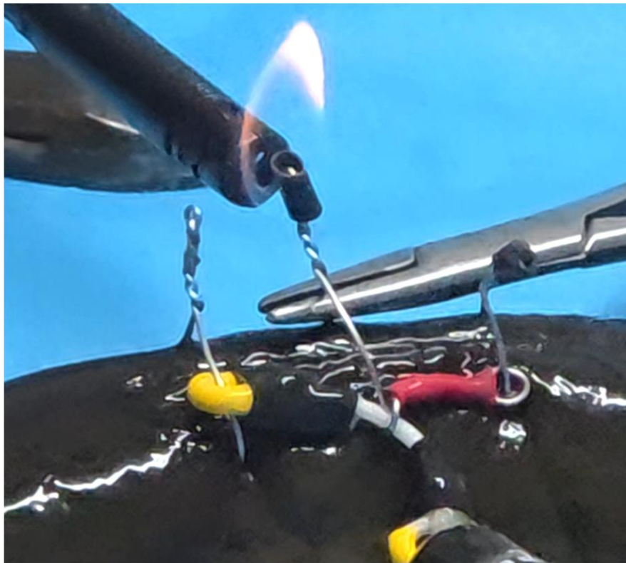
Figure 8: A three-point attachment harness extends the retention period for the external tag. The release or bottom nose cone of SeaTag-3DS is at the very bottom of this picture.

loops is connected to its own attachment point of a small harness. Figure eight shows the yellow loop (front), the forward loop of a stainless steel, red shrink tube covered linkage (center), and the aft loop of the same linkage (rear). When the fish is swimming and the tag pivots back parallel to the eel's body, the front attachment first serves as the anchor. If it starts pulling out, force is shifted to the center loop, and after that to the rear wire loop. The drag force may also be split to some degree among the three wire loops. Wires are bent over to prevent sharp edges, and stubs are covered with shrink tubing. Shrink tubing and epoxy are also used cover and secure knots in the white rope that connects to the release mechanism nose cone at the bottom of the SeaTag-3DS tag.