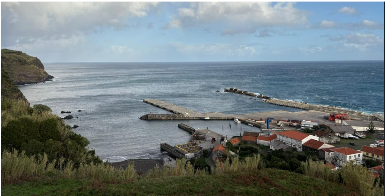
Figure 5: Above Lajes harbor and beach on Flores Island, where the eels were released