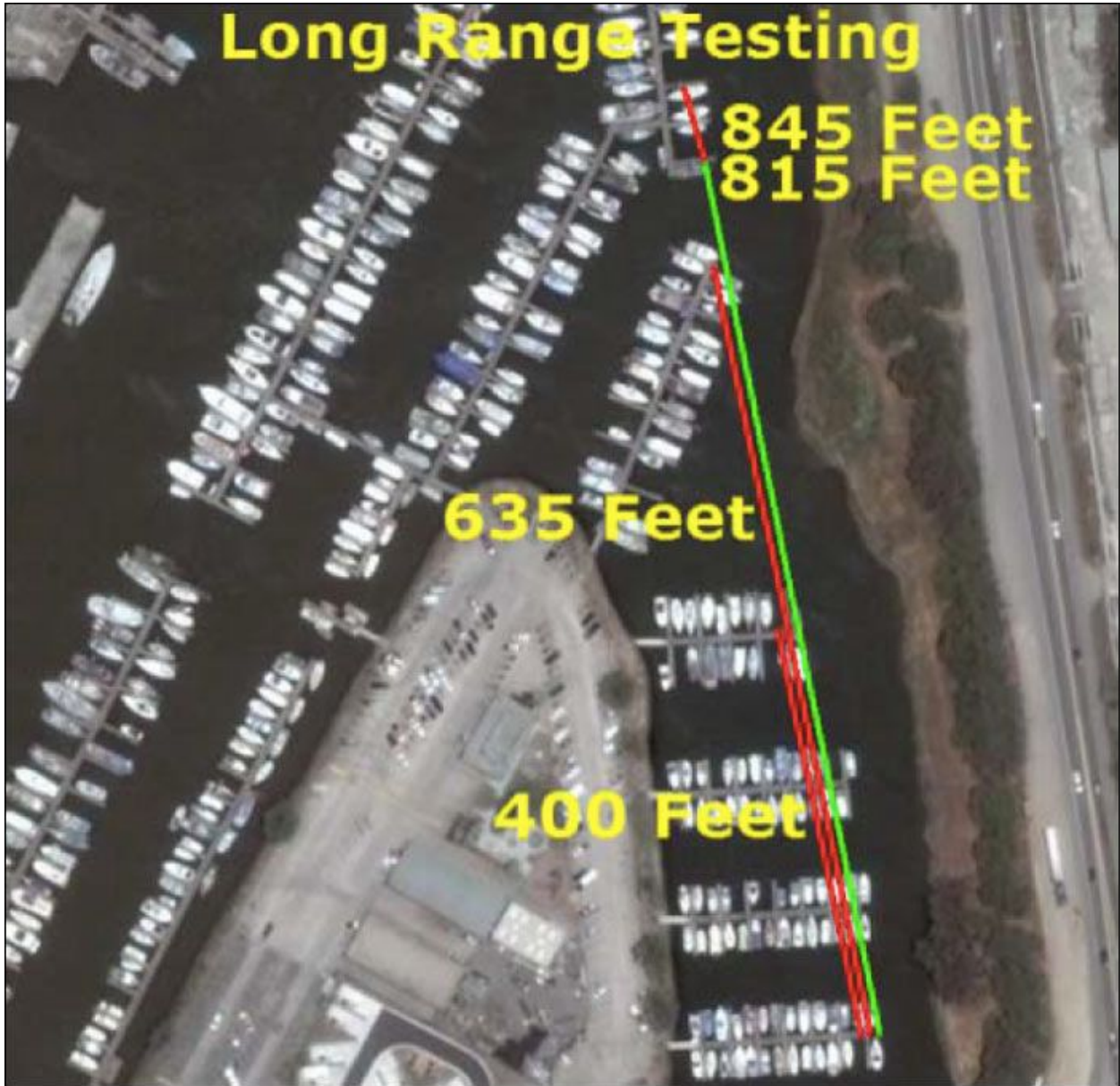
Figure 10: Long Range Testing