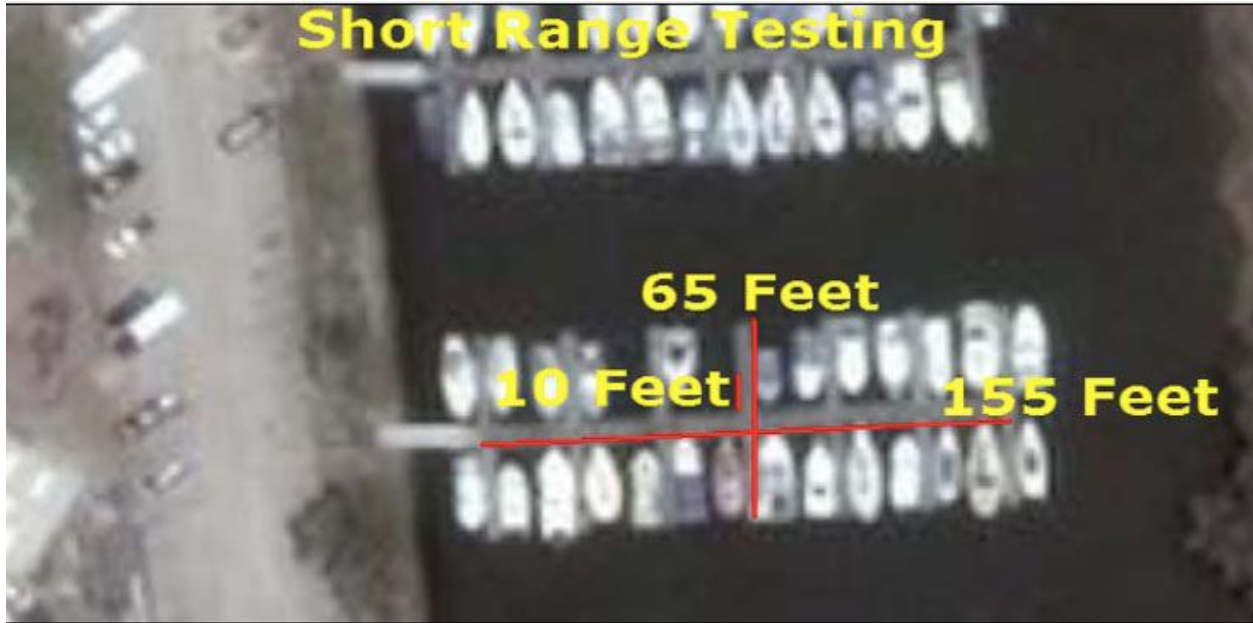
Figure 9: Short Range Testing

In Figures 9 and 10, we were to verifying that the SAM's would have the ability to transmit data in short and long ranges. We tested from 10-845 feet on all the telemetry speed channels and at a variety of thresholds. From 815 Feet and beyond, the data was no longer received. The results remained equal regardless of separation.